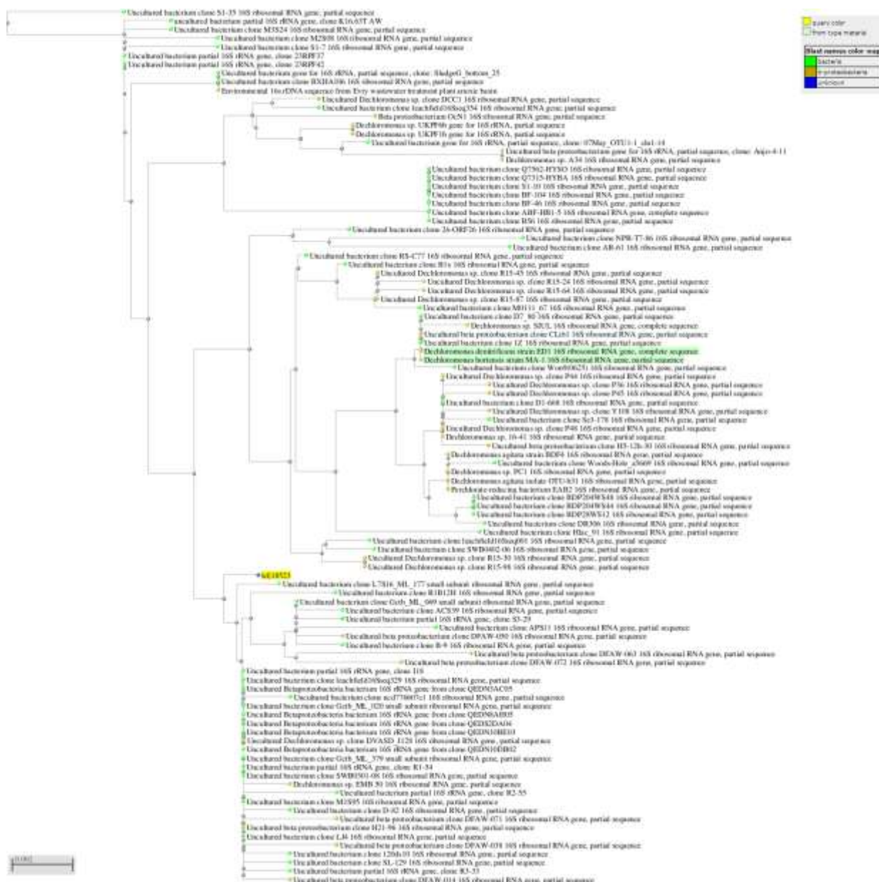
Figure 2. The phylogenetic evidence of identified isolates of Cd2; Extracted from BLAST database.