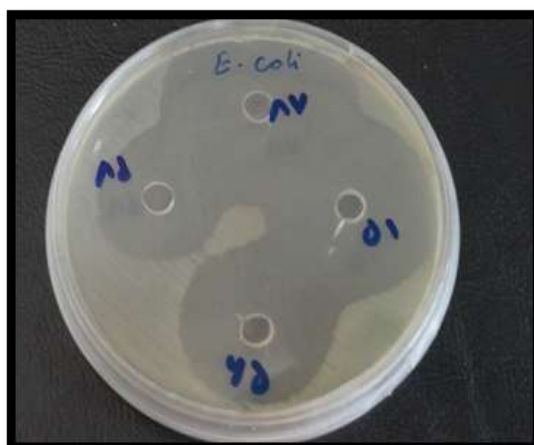
Fig 1. Synergistic effect of extracted metabolites from isolated Rhodococcus